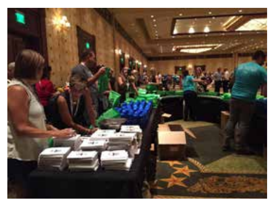
Medifast® introduced Take Shape For Life® Cares, a charitable effort whose main objective is to give back to underprivileged communities through an association with organizations which align with Take Shape For Life's mission of Optimal Wellbeing ^{\text{\tiny{M}}} .