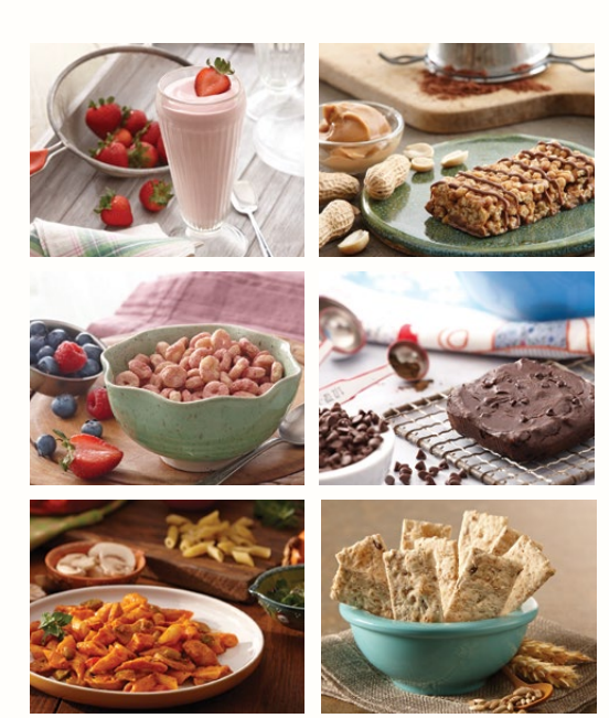
New Product Photography