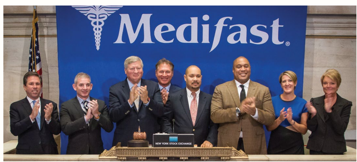
Medifast leadership team rings the New York Stock Exchange closing bell

We also identified new opportunities to enhance our e-Commerce platform and improve the customer experience. In 2016, we will implement a number of short- and long-term initiatives to