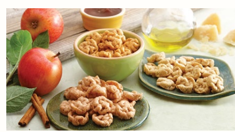
Barbecue, Parmesan & Olive Oil, and Apple Cinnamon Pea Crisps